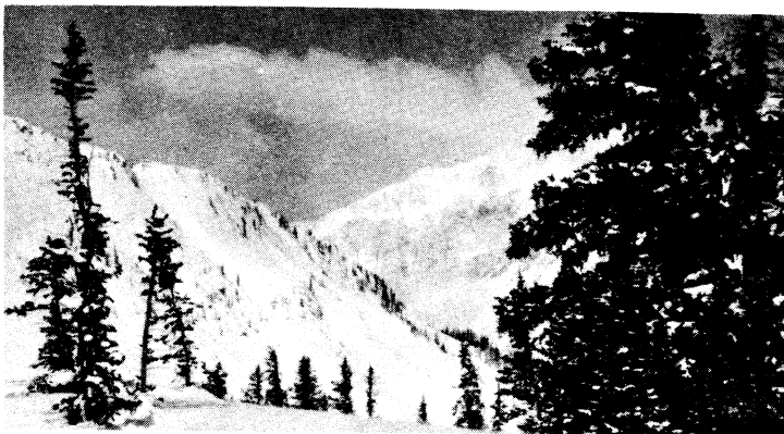
Red Pine Tour, March, 1975