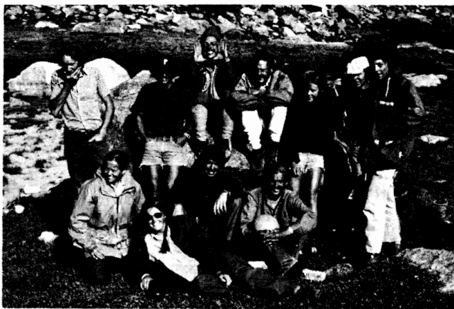
WIND RIVER Encampment over Labor Day, 1975.