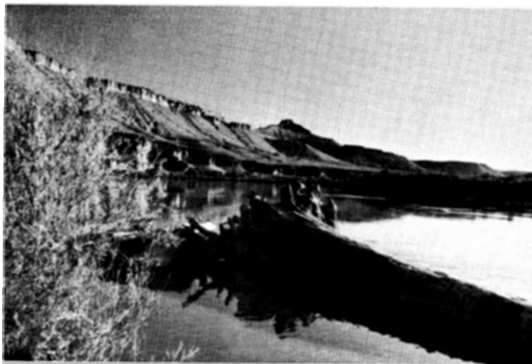
The put-in at Sand Wash (Deso trip).