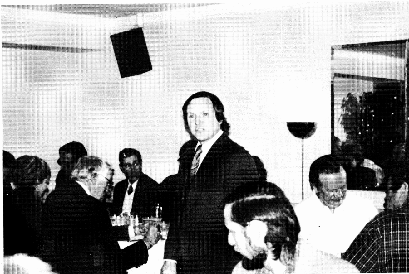
Nominations Banquet photos by Ron Perez.