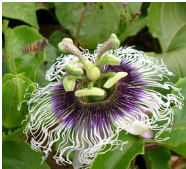
A wall lined with wild flowers grow outside my front gate. A bee hovering above one (11/13 HK).

FEB 8 THU - 12 MON BIKE ROAD: DEATH VALLEY - CALIFORNIA. If you would like to escape from the wintertime chills and smog and have a great time too, come on the Death Valley bike ride with the old ranger, Bob Wright. There will be biking, hiking, swimming and relaxing. We will stay at the Furnace Creek campground. It is comfortably warm during the day and not too cold at night. Precipitation is usually minimal. We can visit many of the local attractions including Scotty's Castle, Ubehebe Crater, Stovepipe Wells, Badwater and many others. We will car pool as much as possible. It is 545 miles each way from Salt Lake via Las Vegas. We plan to do group cooking. Estimated cost is $50.00 per person including food and camping. Food and camping fees are included but park entrance fee and transportation is not. We will have a planning meeting Thursday, Jan. 25th at Bob and Denna Wright's house, 1832 Meadow Moor Rd. (5000 South) at 7:00 PM. Call Bob at 801-274-07566 to register or E mail at bobanddenna@MSN.com