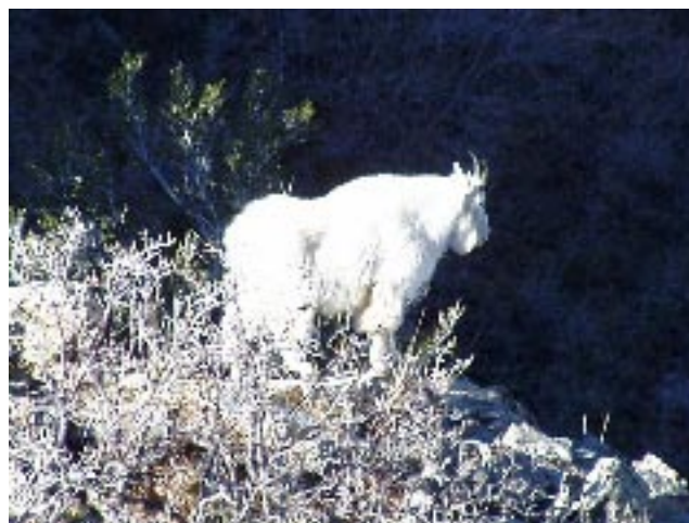
Mountain Goat.