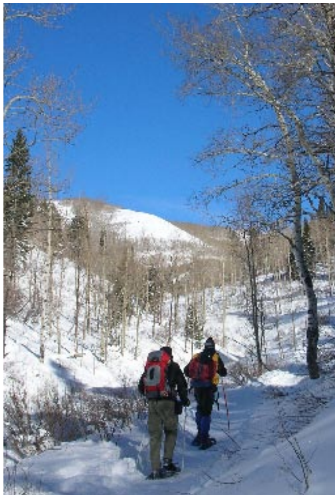
Christal's Dec 3rd Snowshoe Trip to Dog Lake.

***Participation in any WMC activity can be dangerous. It is your responsibility to evaluate your own preparedness and ability to safely participate in any activity. Please be sure to read and re-read the release forms in the back of this publication, as well as on the sign-up sheets at the beginning of each activity!!!!