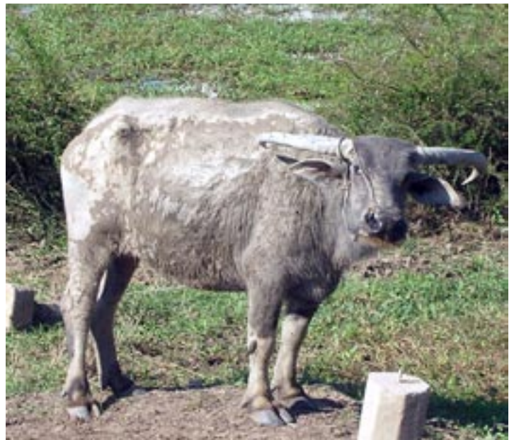
A Cambodian buffalo 20th Nov.

Mar 2 SNOWSHOE (MOD) Snow Caving/Camping: March 2/3 Snow caving- winter camping trip. Spend a night in the snow, in a snow cave, or if you want an easier but colder night, in a tent, on the mountain up towards Guardsman Pass, on a night with a full moon. Snowshoeing or skiing during the day, with maybe a little jaunt by moonlight, topped with a little howling at the moon, with a cup of your favorite hot beverage. A great adventure with assistance and backup by experienced winter campers and snow cavers. Sign up with Rick Thompson at gone2moab@hotmail.com Meet at TBD @ 4:00 PM, 801.255.8058 gone2moab@hotmail.com