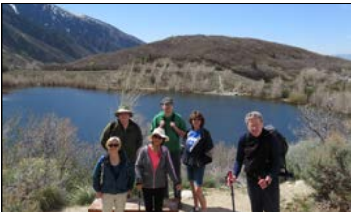
Group at the overlook (top); Mountain goat (above left); At the bridge (above); At the lower reservoir (left)