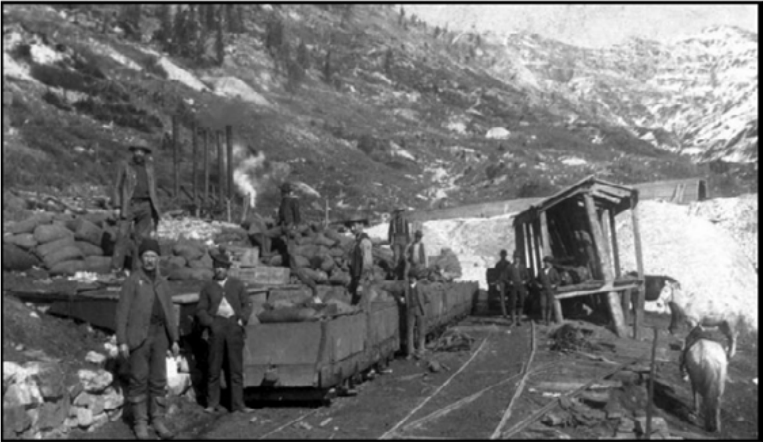
The horse tramway between Wasatch and Alta had its upper terminal at the Bay City tunnel, shown in this photograph. The tops of the Bay City buildings and snowsheds can be seen above the dump in the background. The multiple smokestacks at the left rise above the boiler room. Ore sacks are being loaded into the cars.

property at public auction. The purchaser was an intermediary who immediately transferred it to the newly formed Bay City Tunnel and Mining Company. These activities in St. Louis had little effect at Alta, where the tunnel had a length of 1,200 feet by mid-1875. At the end of that year it was reported the tunnel had struck an ore body well below the deepest workings of the Emma mine. While this was followed by other reports and speculation, none of the reporters had been in the tunnel to see what was there. Superintendent Tully's miners continued working, but all oth-