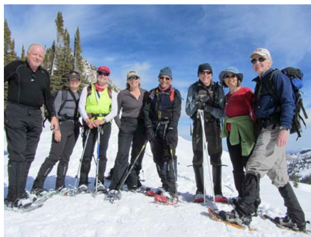
February snowshoe to Mt. Wolverine.