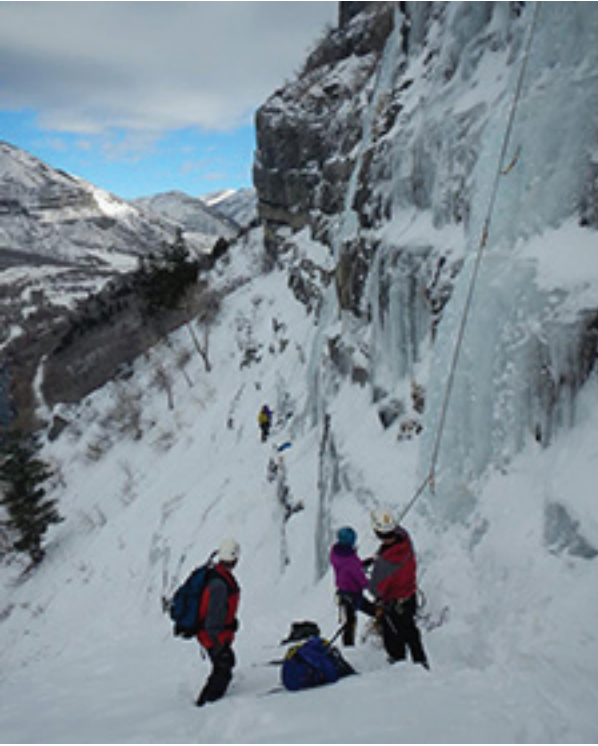
Members climbing on the Apron to Bridal Veil Stairway to Heaven.